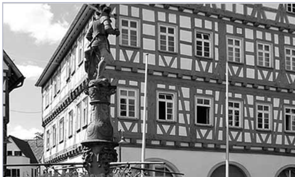
JAKELSKI & ALTHOFF IS LOCATED IN LEONBERG / GERMANY

Our services include the filing of protective rights of all kinds, both nationally and internationally.